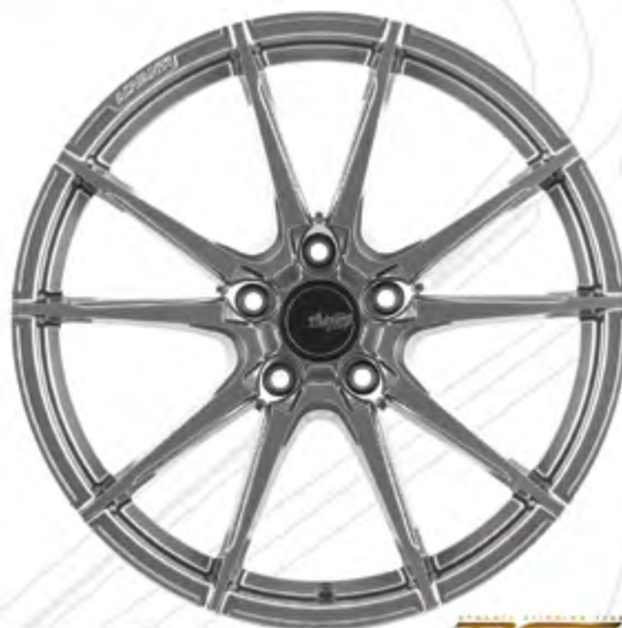
APPELLO 18", 19", 20"