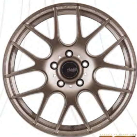
VIGOROSO V1 17", 18", 19"