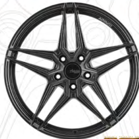
DECADO 18", 19", 20"